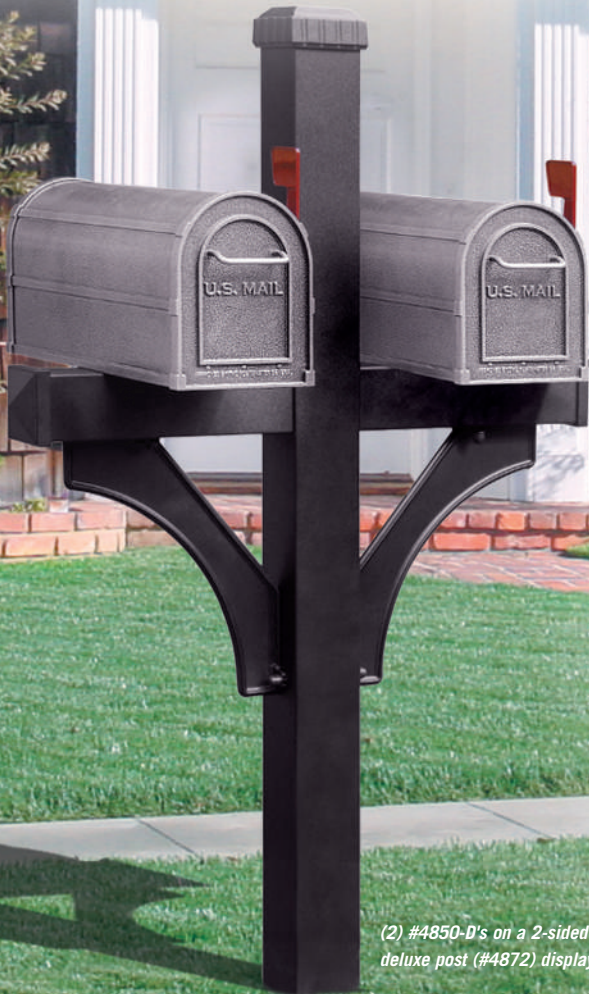
(2) #4850-D's on a 2-sided deluxe post (#4872) displayed.